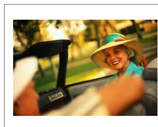
Hey, that lady looks like one of our SCC members.

important part, the fact that we have a newsletter is not the important part either. The important part is that it may be something that we can all contribute to, can all take interest in and can continue to submit our ideas to make it better.