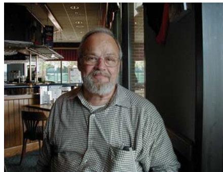
Ok, so I'm not Brad Pitt, but my family still loves me!