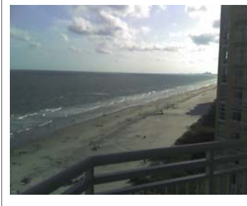
North Myrtle Beach from our condo's balcony.

So let us know a bit about the location where you live. We