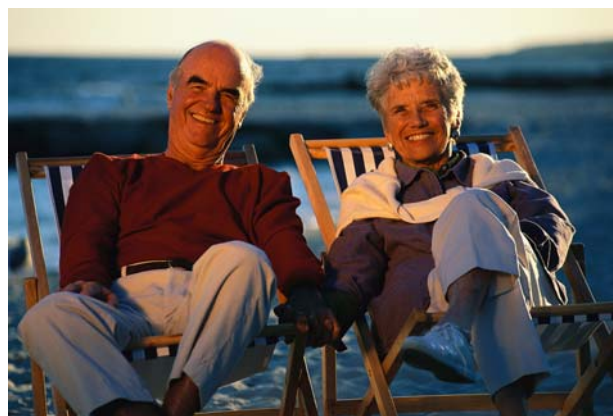
A beautiful sunset, and a life partner, what could be better?

The Newsletter will also provide us with a medium for discussion on our organization, nominations for positions within the organization and additional updates regarding these positions.