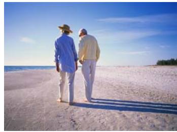
Strolling the beach with no destination in mind.

cial place where you enjoy your leisure time or the great city or town where you live. Who knows, we may all want to visit your town.