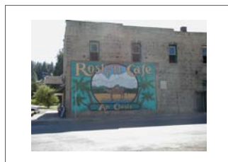
The Rosslyn Café, from Northern Exposure

in the Brick House, which is the oldest operating Saloon in the state being in continuous